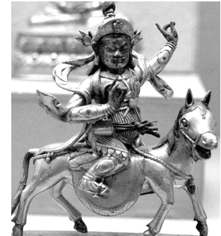
Mongolian National Museum of History, Ulaanbaatar.

FEBRUARY 22 AND 23, 2008 HERBST THEATRE SAN FRANCISCO