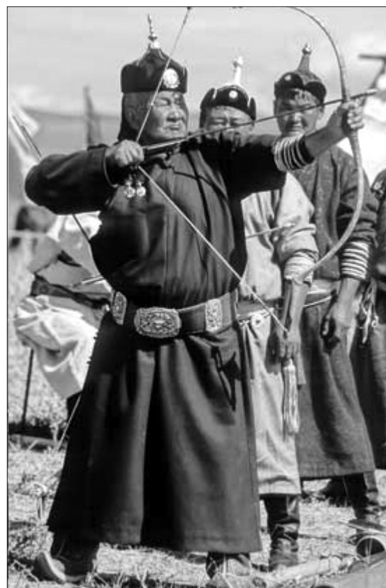
Archery contestant, annual Naadam Festival, Karakorum, Mongolia, 2005.

Member, Humanities West Board of Directors