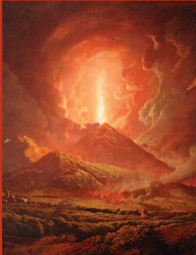
VESUVIUS FROM PONTICCI BY JOSEPH WRIGHT OF DERBY (1784–1793), CA. 1775. ART COLLECTION OF THE HUNTINGTON LIBRARY, PASADENA, CALIFORNIA

Herbst Theatre San Francisco 415.392.4400 Cityboxoffice.com